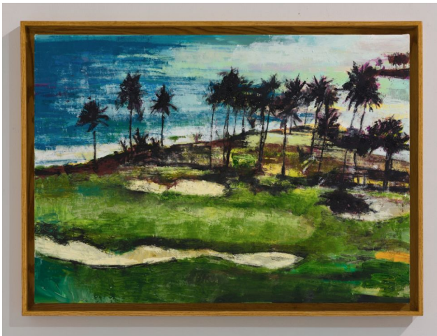
ABOVE

This year's fair also comes with programme of lectures and seminars by art experts from Hong Kong, hosted by The Ink Society, the Hong Kong Palace Museum and L'école Asia Pacific: School of Jewelry Arts.