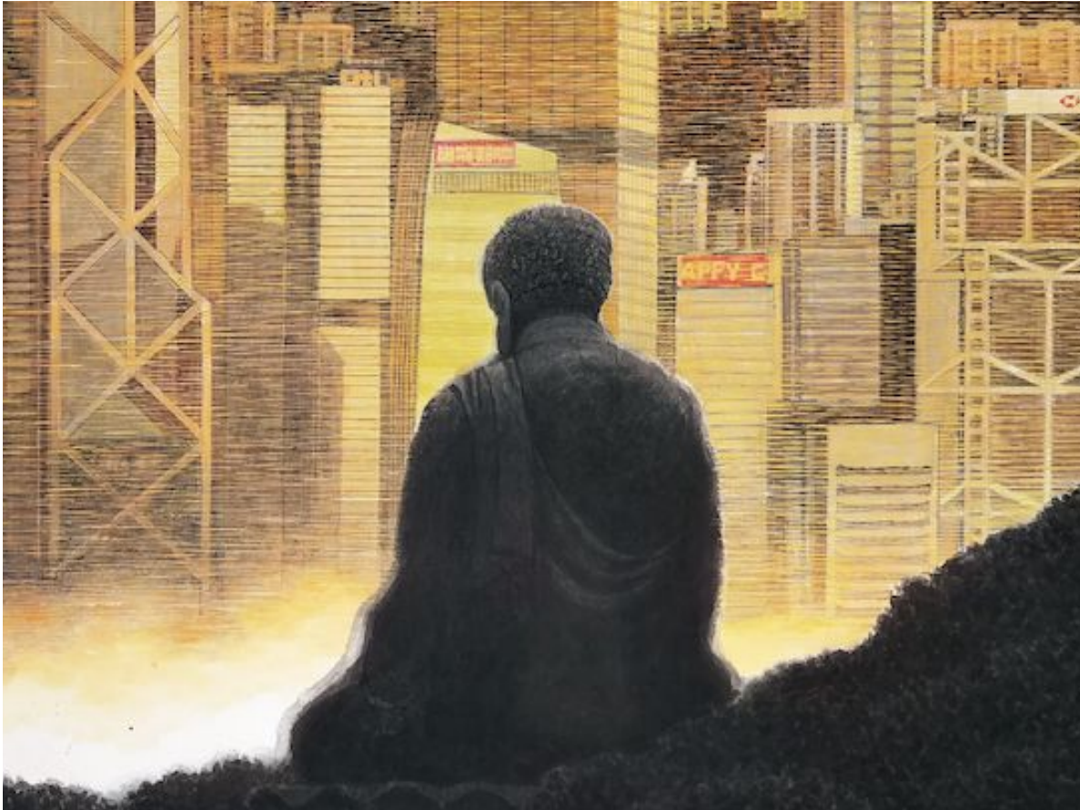
COVER

Hong Kong’s antiques, jewellery and art fair returns this month with a Web3 gaming experience and major names on the scene